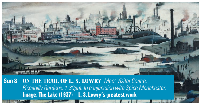
Sun 8 ON THE TRAIL OF L. S. LOWRY Meet Visitor Centre, Piccadilly Gardens, 1.30pm. In conjunction with Spice Manchester. Image: The Lake (1937) – L. S. Lowry's greatest work