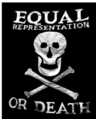
The perils of Peterloo