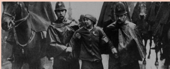
Above: Sylvia Pankhurst being arrested Right: Alan Turing