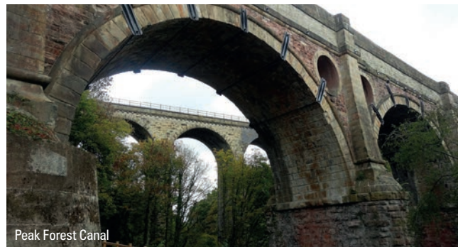
Peak Forest Canal

Sun 26 GRAND CANALS EAST Meet Malmaison Hotel, No. 3 Piccadilly, 3pm.